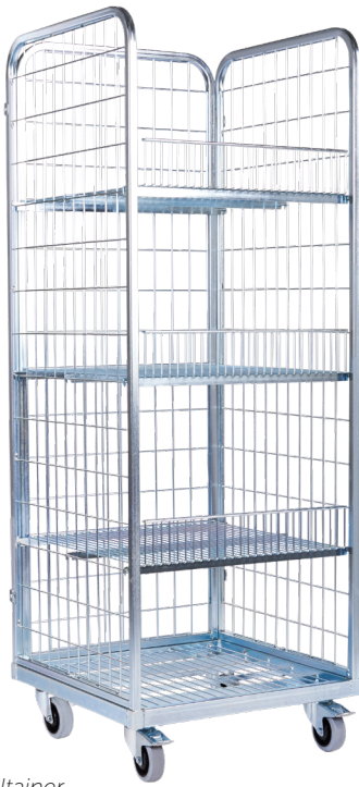
Metal rolltainer 3-sided, with shelves 600 x 600 x 1650 mm