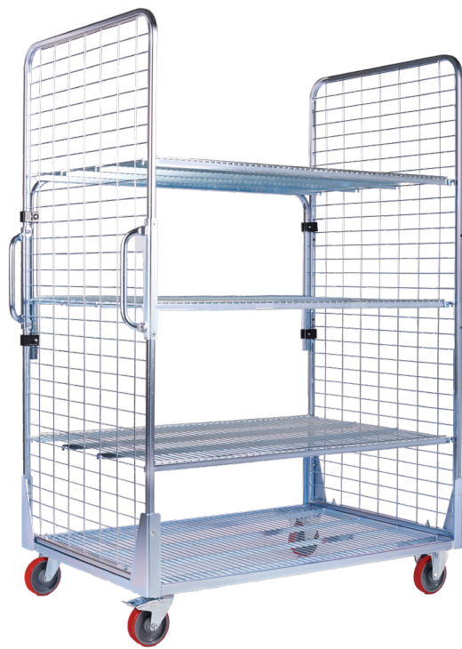
rolltainer® metal 2-sided with shelves 820 x 1260 x 1790 mm