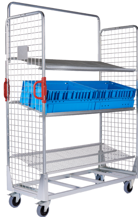
rolltainer® metal picking trolley 550 x 1300 x 1750 mm