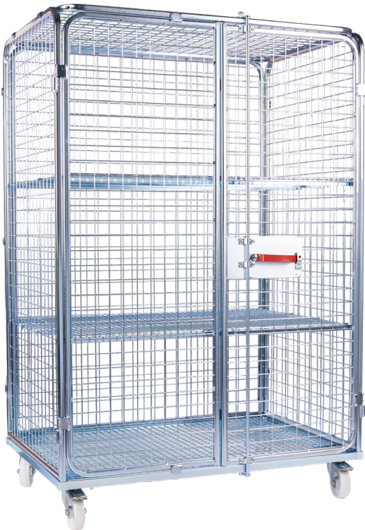
rolltainer® metal Anti-theft 800 x 1200 x 1790 mm