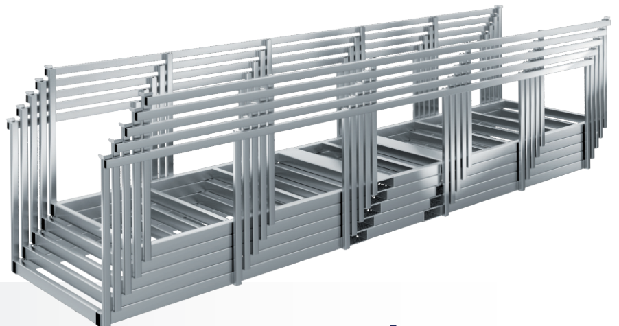
Long goods frame, stacked