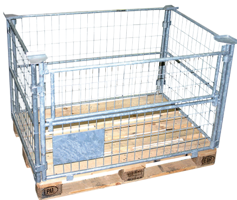
Galvanised lattice stacking frame, high loading capacity and load