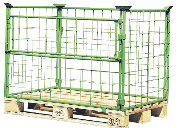
Standard lattice stacking frame